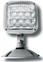
DIMENSIONS: 4-1/4" x 6-5/8"